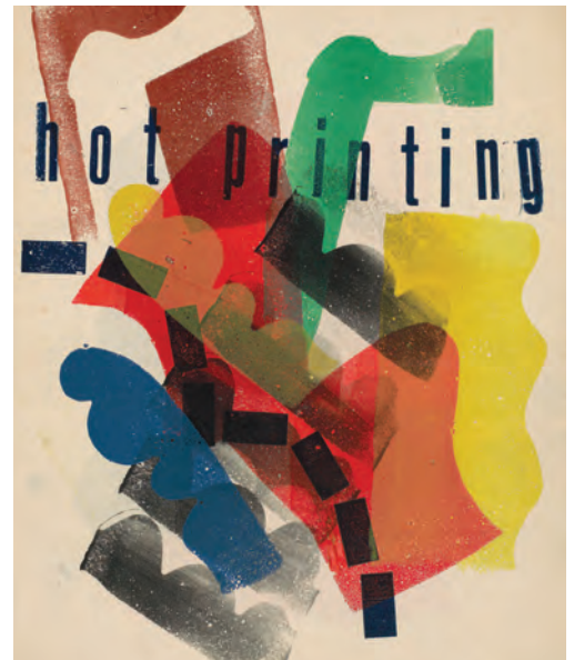
Photos clockwise from top right: Map of the region; Bruges, Belgium; Hot Printing, 1935-1936, template and hand press on paper, The GRID Grafisch Museum Groningen, Holland; Keukenhof Gardens, Holland; Mauritshuis, The Hague, Holland, Lübeck, Germany. Front cover: Mont-Saint-Michel, France. Back cover: Copenhagen, Denmark (top); Groninger Museum, Holland (bottom).