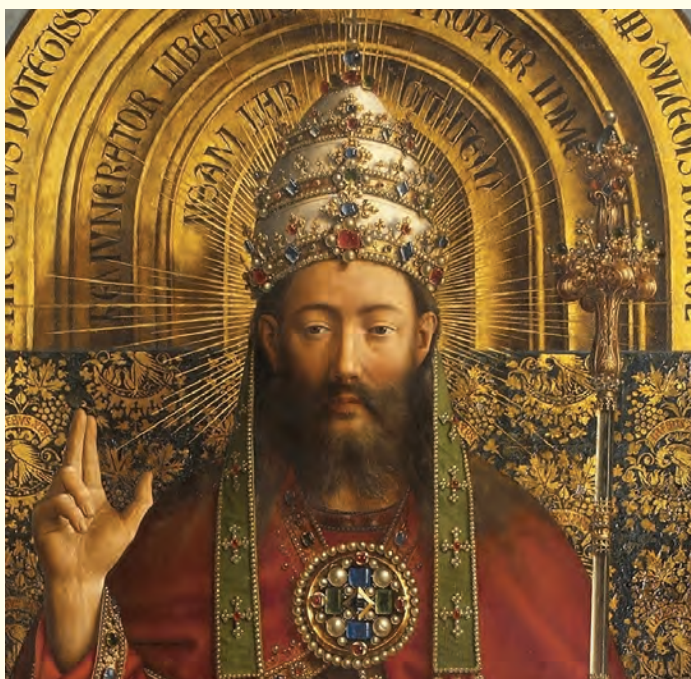
The Adoration of the Mystic Lamb (detail), Ghent, Belgium