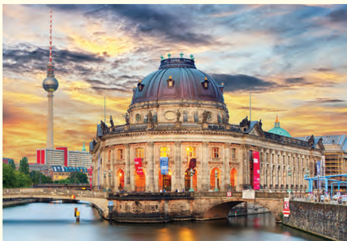
Museum Island, Berlin, Germany