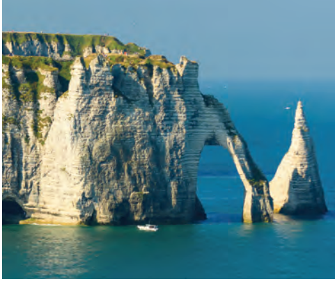
Les Falaises d'Étretat, France