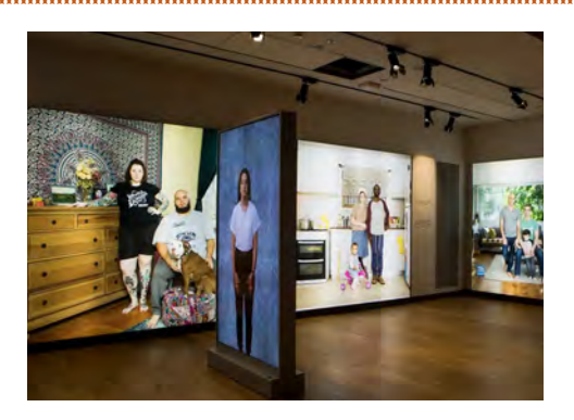
ANU Museum of the Jewish People, Tel Aviv

This itinerary is subject to change at the discretion of The Metropolitan Museum of Art and Arrangements Abroad. For complete details, please carefully read the terms and conditions at www.arrangementsabroad.com/terms.