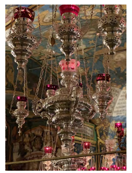
Church of the Holy Sepulchre, Jerusalem