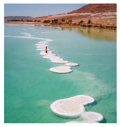
Dead Sea, Israel