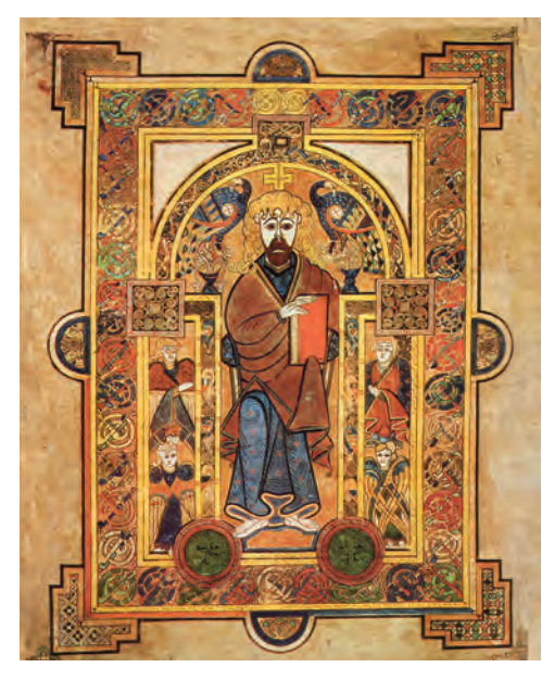
The Book of Kells, Trinity College, Dublin